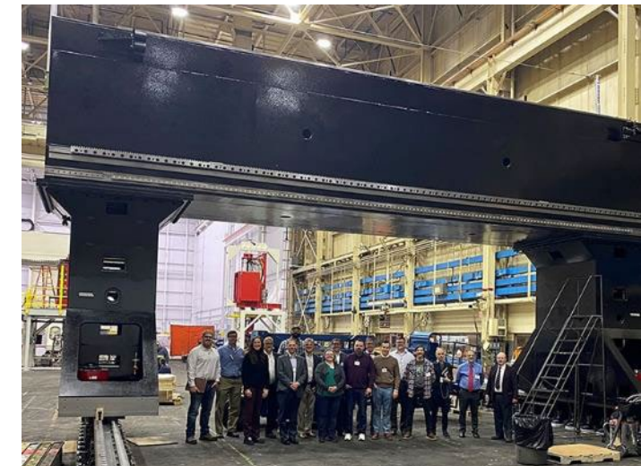
The Jointless Hull Machine at Rock Island Arsenal