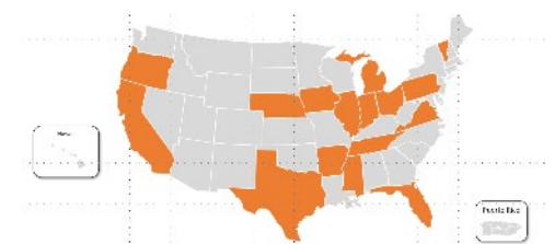
States where IGNITE is active